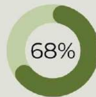
MAS - Manchester

This steadiness is provided by the many who comes to clinic and pay for their acupuncture treatments; by the Board of Directors who maintains a bird's eye view for the organization; by MAS Supporters who provide invaluable additional funding and our terrific staff for whom the work at MAS is a vocation.