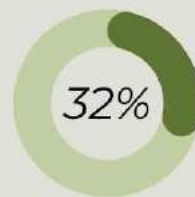
MAS - Nashua