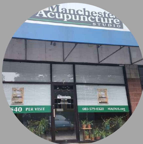
Storefronts in Manchester (left) and Merrimack (right)